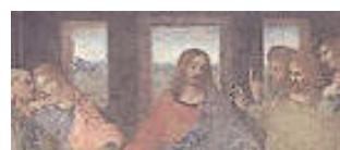
Last Supper Tickets